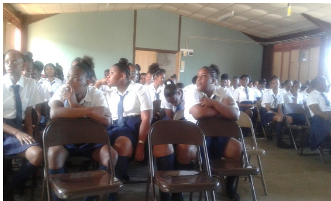
St. Martin Secondary School

Some of the schools sensitized included the St. Mary's Academy, the Wesley High School , the Orion Academy , the Castle Bruce Secondary School, Portsmouth Secondary School, Seventh Day Adventist School, the Goodwill Secondary School and Pierre Charles Secondary School.