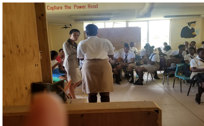
North Eastern Comprehensive School