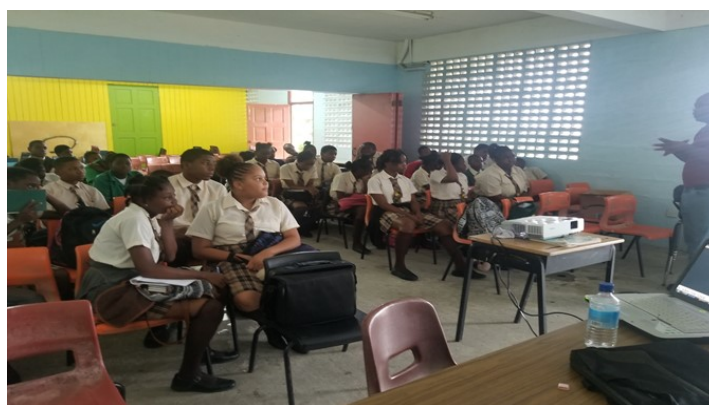
Isaiah Thomas Secondary School