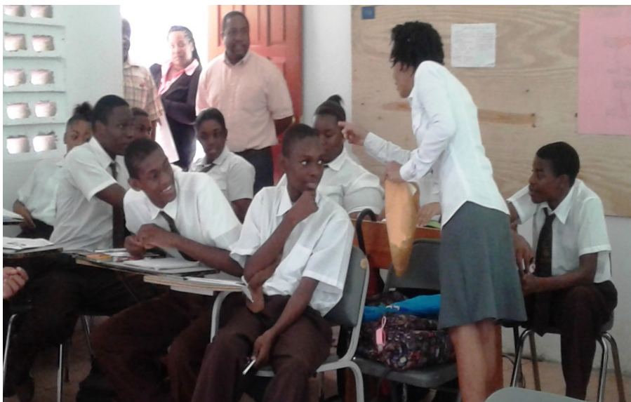
A back section of the class room of forth formers of the Dominica Community High School getting prepared to respond to a question on Electrical Hazards , while some of the teachers present looked on.

Thirteen of the targeted secondary schools on island have so far been sensitized. Both students and teachers have been embracing the information provided, as they recognize the seriousness of hazards and how easily it could negatively impact health, property and the environment.