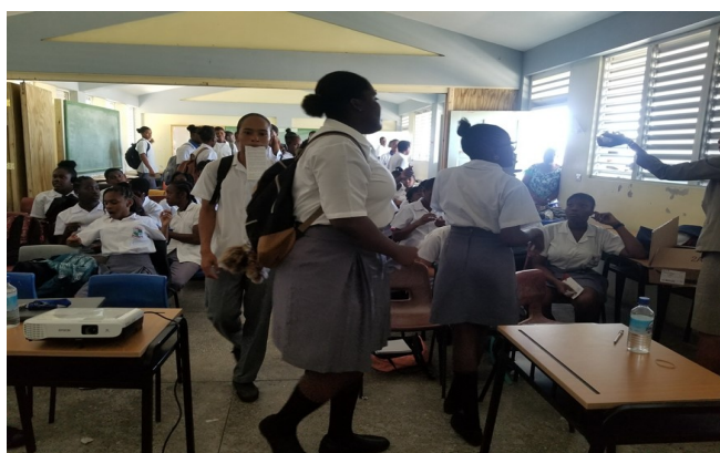
Portsmouth Secondary School