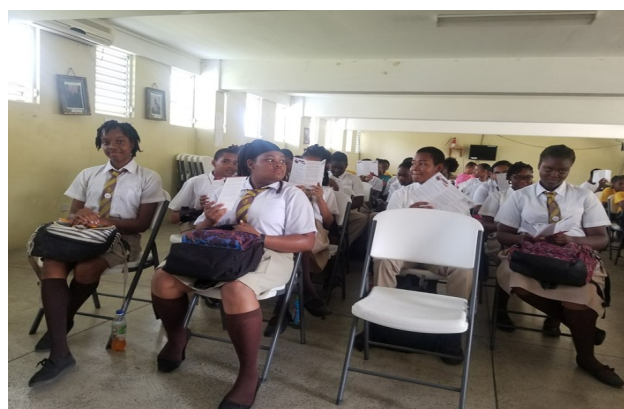
Dominica Grammar School